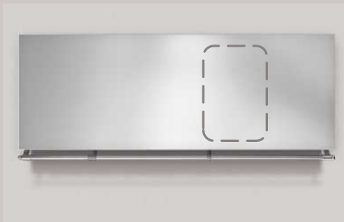
Blank worktop section £0