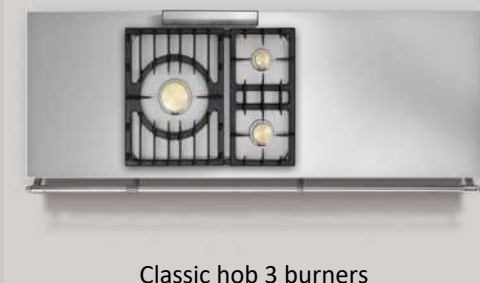
Classic hob 3 burners