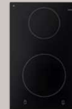
2 x induction rings £1,300

Can only be fitted next to Classic or Traditional hob options