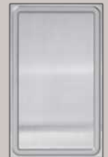
Electric Plancha £1,350

Can only be fitted next to electric hobs