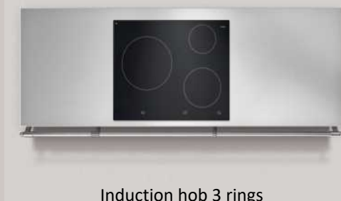
Induction hob 3 rings

2 x 73 litre gas ovens 2 x storage drawers