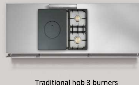
Traditional hob 3 burners with simmer zone