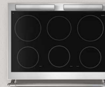
Induction hob 6 rings LVI

1 x 55 litre gas oven 1 x 69 litre dual function oven with grill 1 x storage drawer