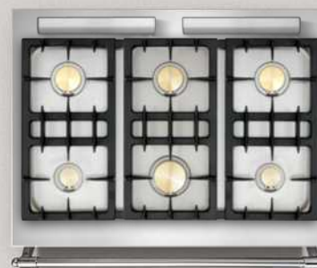
Classic hob 6 burners LG