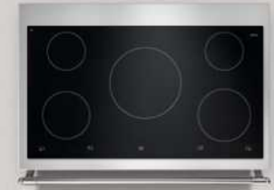
Induction hob 5 rings

2 x 55 litre gas ovens 2 x storage drawers