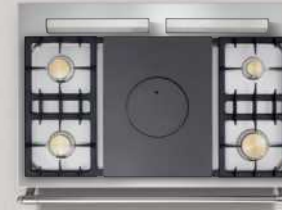
Traditional hob 5 burners with simmer plate