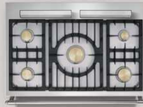
Classic hob 5 burners